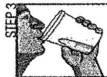
STEP 3 Drink ALL the liquid in the container.