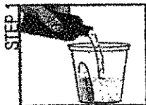
STEP 1 Pour ONE (1) 6-ounce bottle of SUPREP liquid into the mixing container.

• On the morning of your procedure, repeat steps 1 through 4 using the other 6-ounce bottle