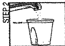
STEP 2 Add cool drinking water to the 16-ounce line on the container and mix.